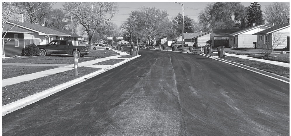
RIVER DRIVE – AFTER