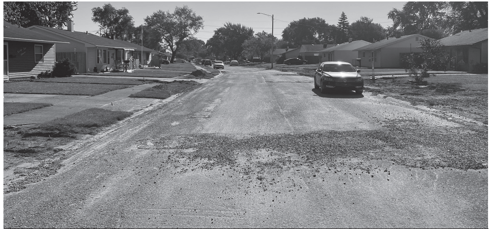
RIVER DRIVE – BEFORE

Printed by Lithographic Communications 9701 Indiana Parkway, Munster, IN 46321