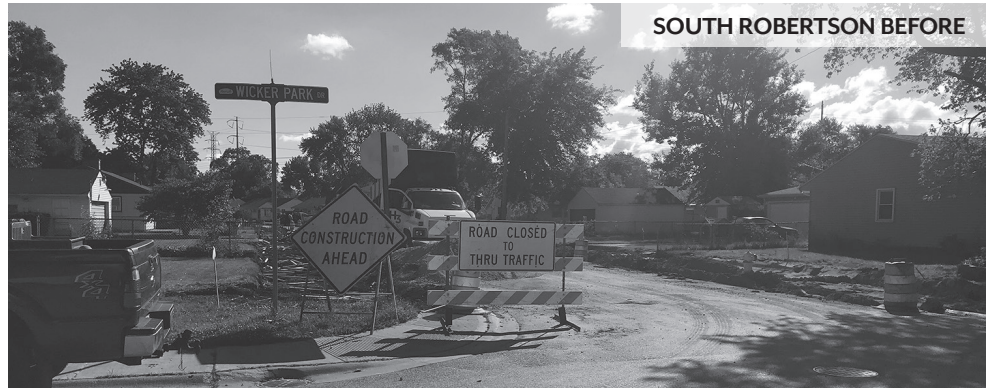
SOUTH ROBERTSON BEFORE

Printed by Lithographic Communications 9701 Indiana Parkway, Munster, IN 46321