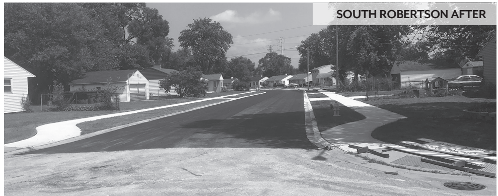
SOUTH ROBERTSON AFTER