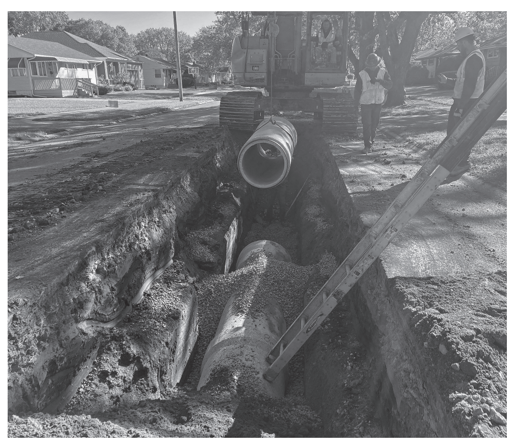
[ THE END OF LAKE LAVERNE ] Workers replace the old 12-inch storm sewers along Laverne Drive with lines that are double the size to reduce flooding. [photo provided]

Printed by Lithographic Communications 9701 Indiana Parkway, Munster, IN 46321