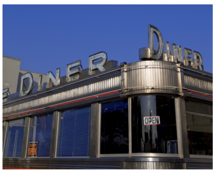
Two signs projecting above roof is not allowed. (Otherwise acceptable design.)

(2) No sign shall extend more than six (6) inches above the roof line for each lineal foot of building wall facing the primary public street.